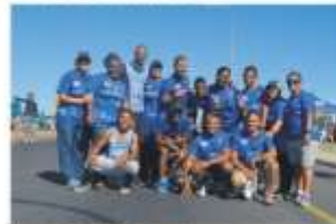
Members of the Portland's Park Team standing with...