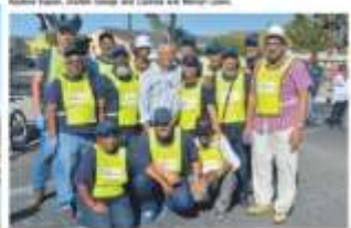
Some of the volunteers who were working on the event.