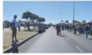
Thousands of people and visitors came together for a day of fun, art to see and all the new bike lanes.