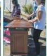
A woman speaking at the podium at the start of the event.