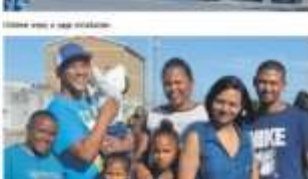
Visitors watch a stage performance.