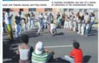
Visitors watch a performance by local artists.